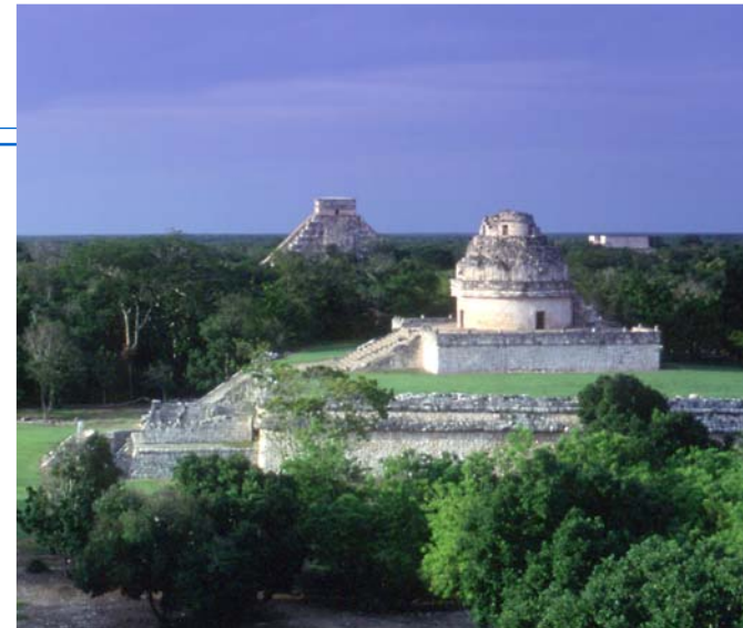
Mexico Tourism Board

the bay, cruise a lagoon, and spend a night in Punta Allen, a sustainable fishing community of 600 inhabitants. Community Tours Sian Ka'an ( www.siankaantours.org ) will take you there and donate 5% of its profits to conservation of the reserve.